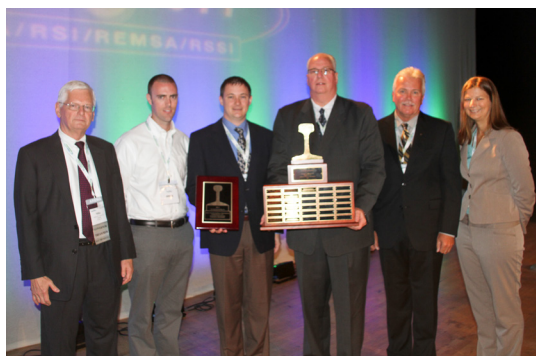
CSX Intermodal Terminals, Inc. accepting the 2011 Hay Award at the AREMA 2011 Annual Conference in Minneapolis, MN.